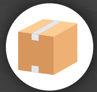
TOP & BOTTOM SEAL