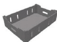
Die-Cut Open Tray