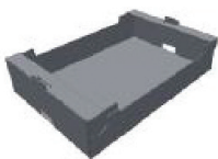
Die-Cut Tray with Flaps