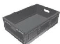
RPC (Reusable Plastic Container)